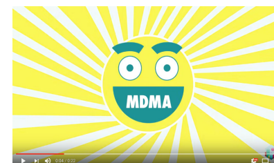
Don't Be Daft