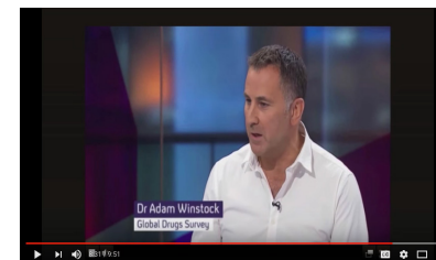
Buying illegal drugs on the 'Silk Road' - as featured on Channel 4 News

We produce a range of straightforward, credible drug education films suitable for a wide range of groups from police, teachers and health workers to parents, festival staff and students. See our show reel on the GDS YouTube Channel.