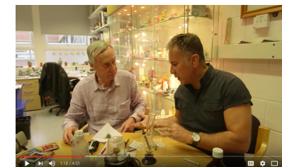
Straightforward drug information films from Global Drug Survey